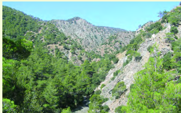
Calabrian Pine natural forest

The gradient of the trail is comparatively gentle, but particular caution is needed where the trail crosses the river, especially during spring time when the water level is high. During winter time and early spring, the section of the trail that runs along the river will be impassable. Loumata river has a considerable flow of water even during summer months. The trail has a peak altitude of 1110m and 1010m at the lowest point. Most of the nature trail forms a section of an old trail, that the labourers of the Amiantos asbestos mine used to follow on their way to the nearby villages.