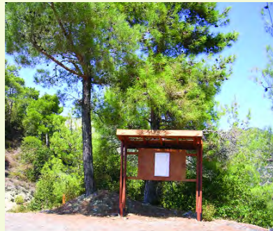
Starting point - Information

It is a linear trail, 2 km long with a walking duration of 0.5 – 1 hour. It starts from a rural road at Kato Amiantos village and passes through a dense forest to reach the «Loumata» river, where it then runs along the river side to end at a village road close to the communal